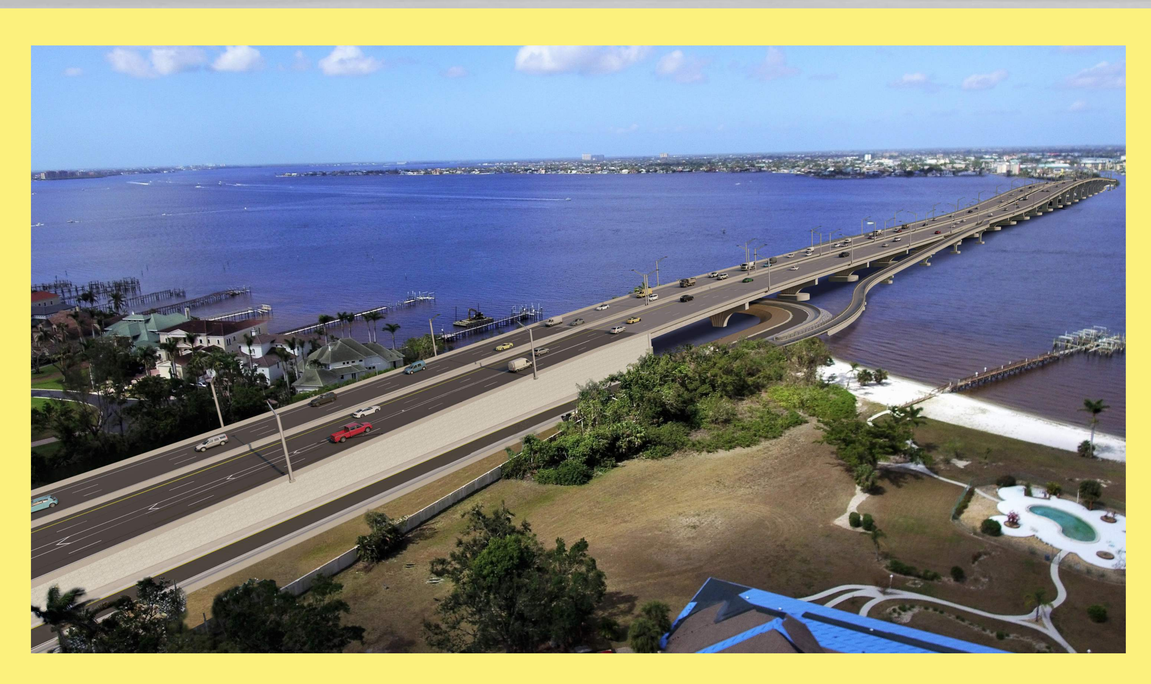
VIEW 1 - LOOKING S.W.